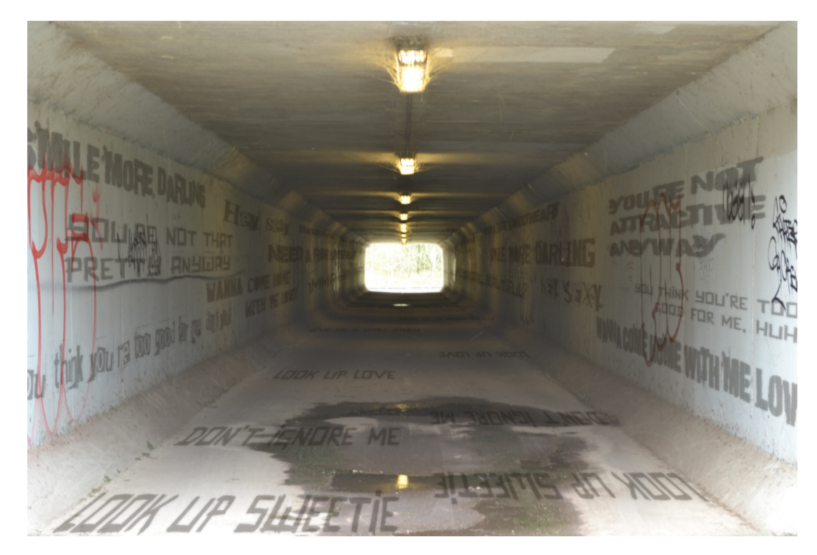
Visual media 1 Street Harassment Tunnel/Walkway Decal