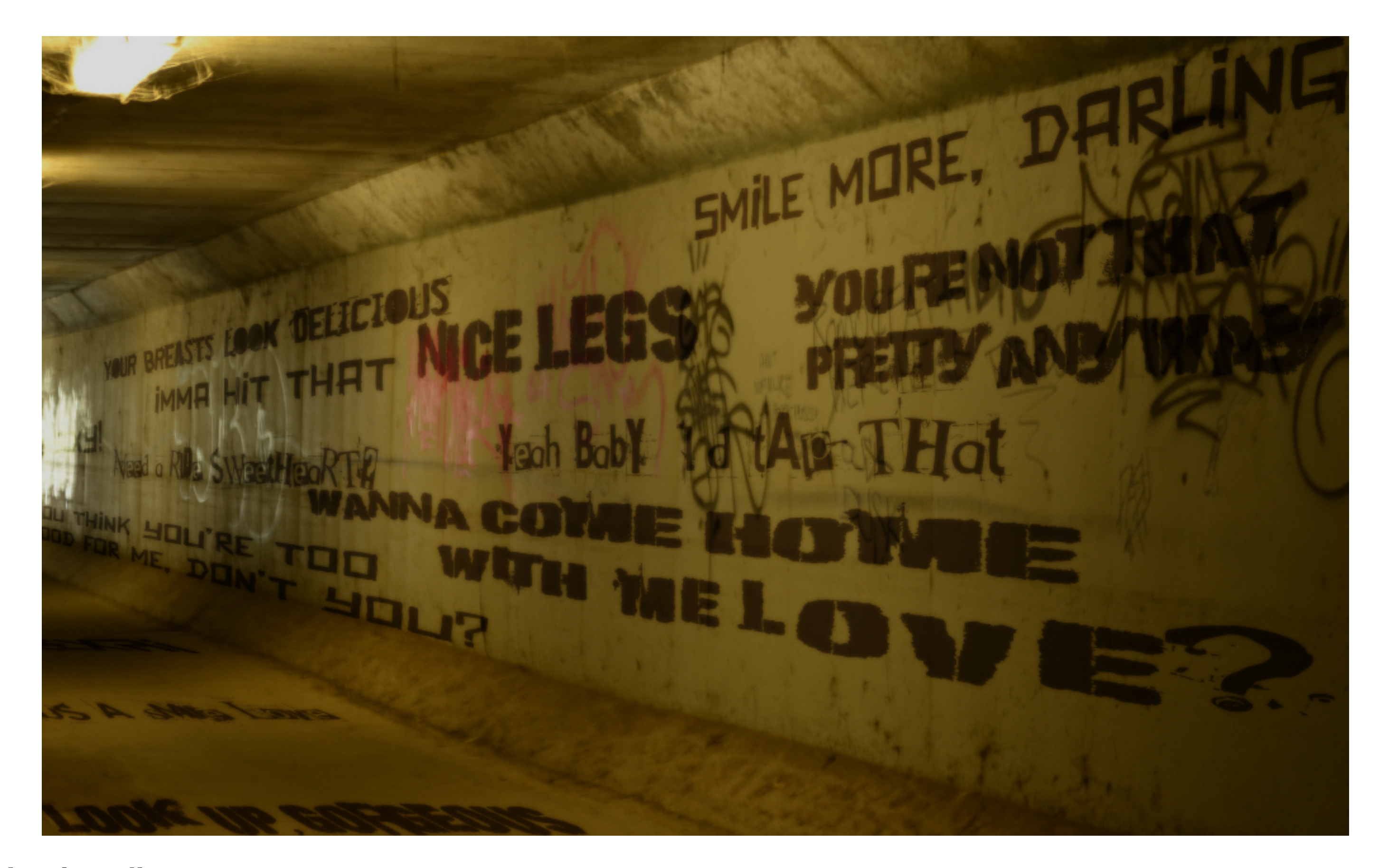
Visual media 1 Street Harassment Tunnel/Walkway Decal