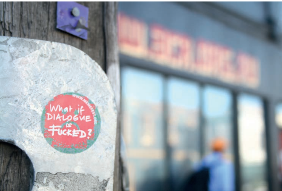
Figure I.1: Memefest sticker in Melbourne.

Environment and Planning D: Society and Space , 34:3, pp. 393–419, London: Sage.