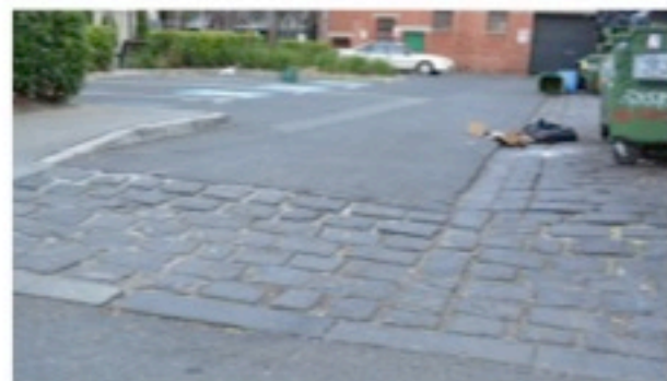
Clear pathways and footpaths