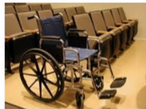
Seating in lecture rooms