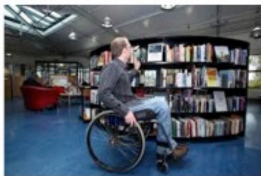
Free movement in library