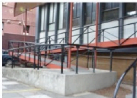
Ramps to buildings