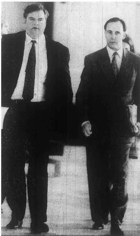
Figure 2 The Australian newspaper, 16 Dec 1993