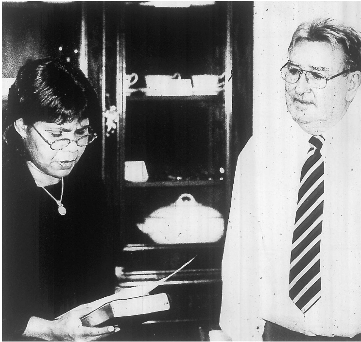
Figure 1 The Australian newspaper, 16 Dec 2003