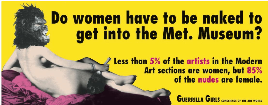
Figure 5 Guerrilla Girls. 1989. Do Woman have to be naked to get into the Met. Museum? Poster. Accessed 20 October 2014.