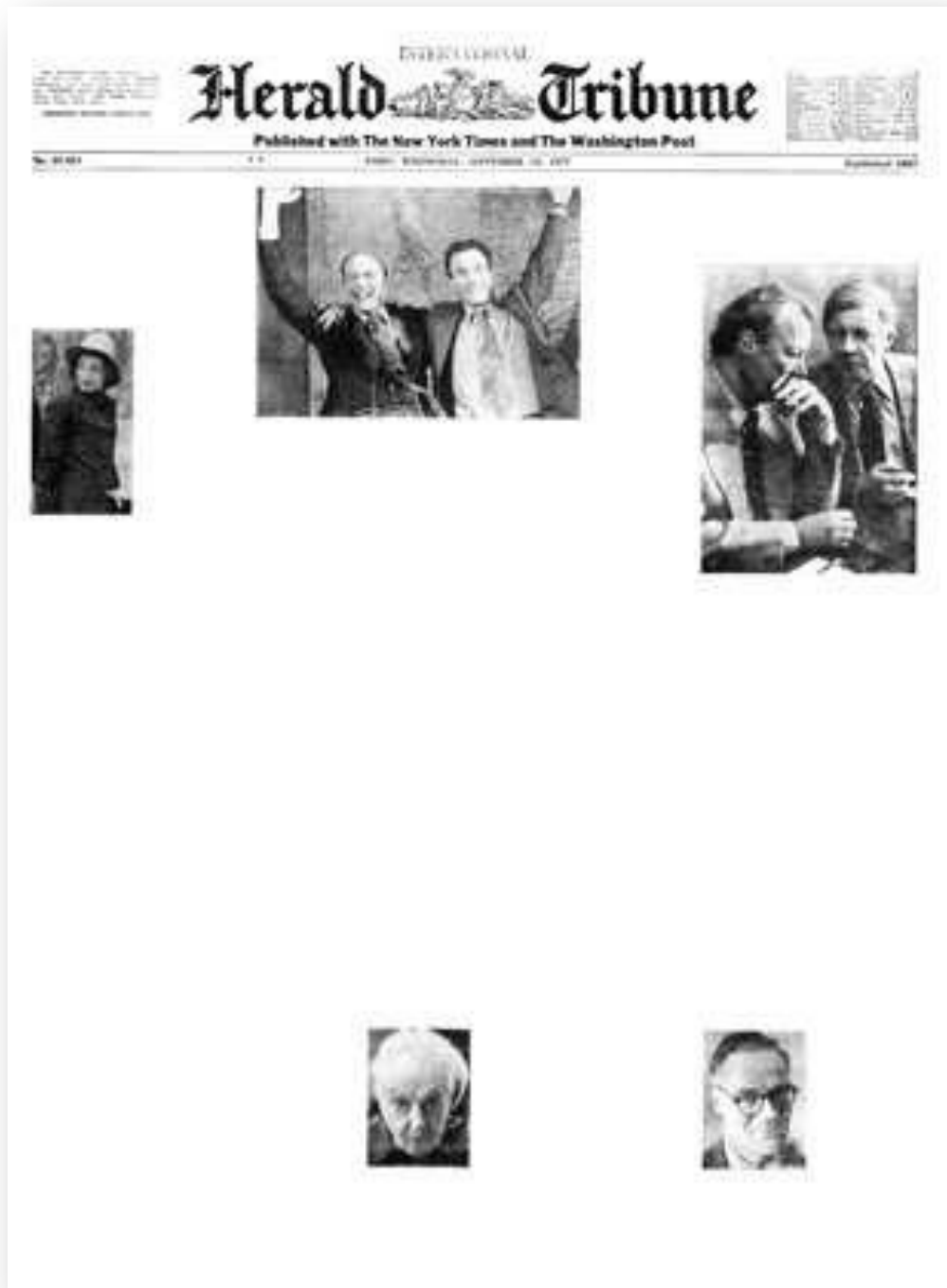
Figure 3 Sarah Charlesworth, Herald Tribune , September, 1977 (Detail from Modern History ), one of twenty-six black-and-white prints, 1977. Reproduced same size as original newspapers, 16" x 23", Winterthur Museum, Winterthur, Switzerland, Addison Gallery of American Art, Andover Vancouver Art Gallery, British Columbia.